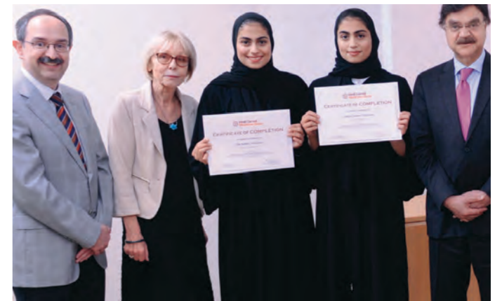
The program's curriculum is very student-centered.

This popularity and reputation for success is undoubtedly due to past innovations. The curriculum is very student-centered and the faculty are highly