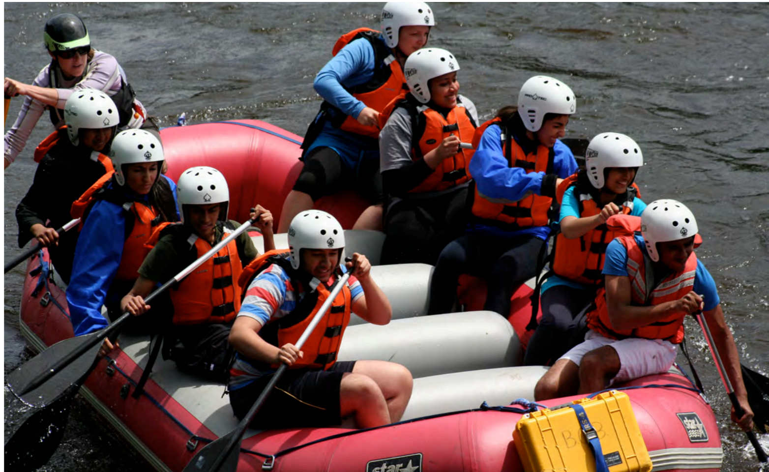
Rafting activity, Ithaca, New York