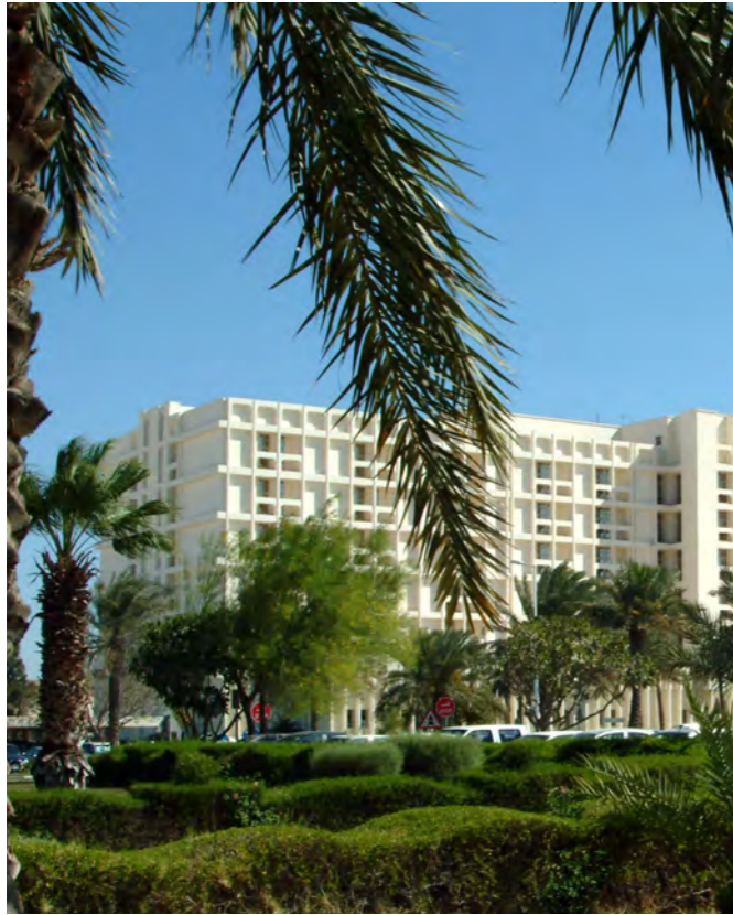
Hamad General Hospital, part of Hamad Medical Corporation