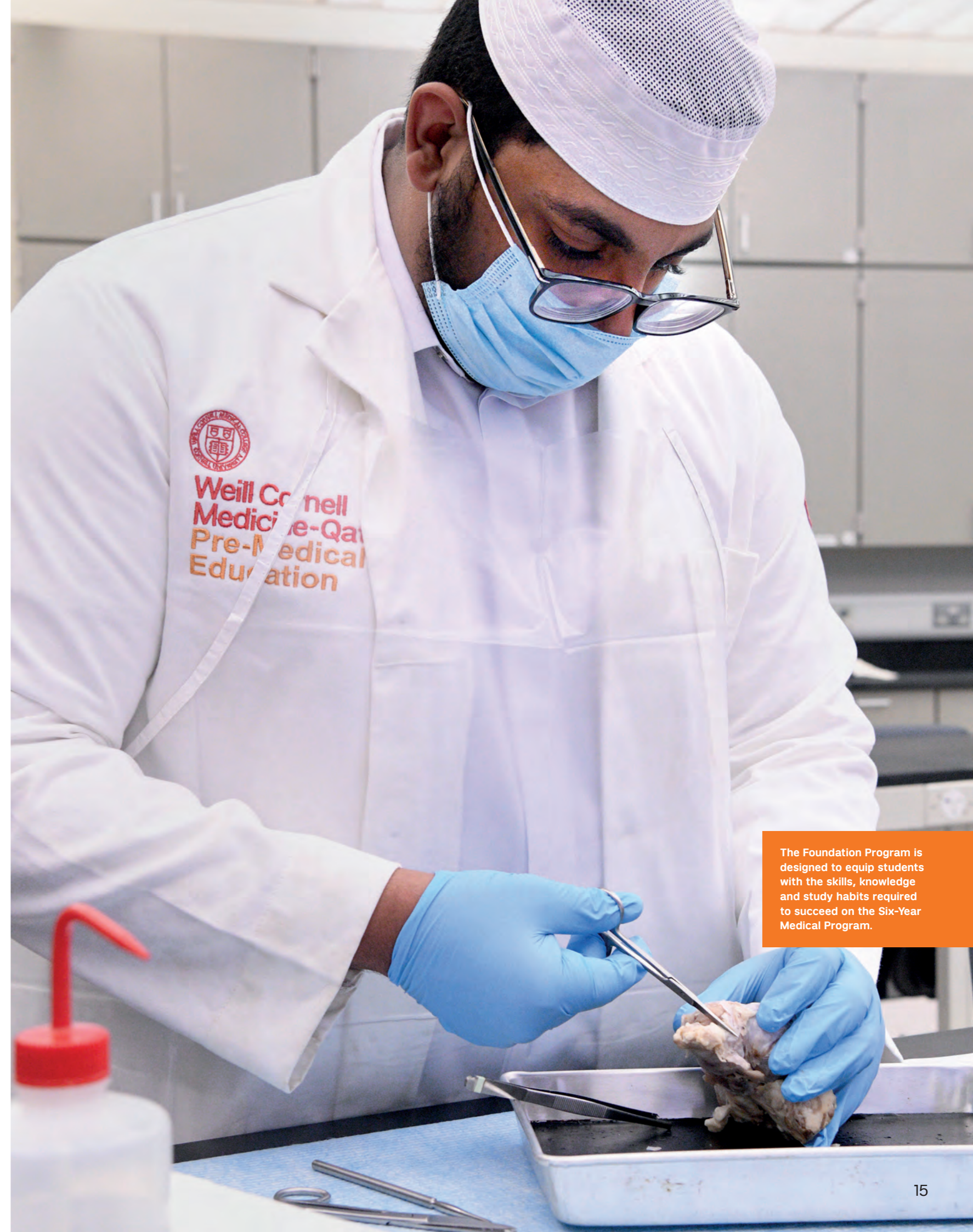
The Foundation Program is designed to equip students with the skills, knowledge and study habits required to succeed on the Six-Year Medical Program.

Combined with co-curricular and leadership activities such as field trips, faculty mentorship, theater productions, and distinguished guest lectures the students complete the Foundation Program with the skill-set required for WCM-Q's Medical Program.