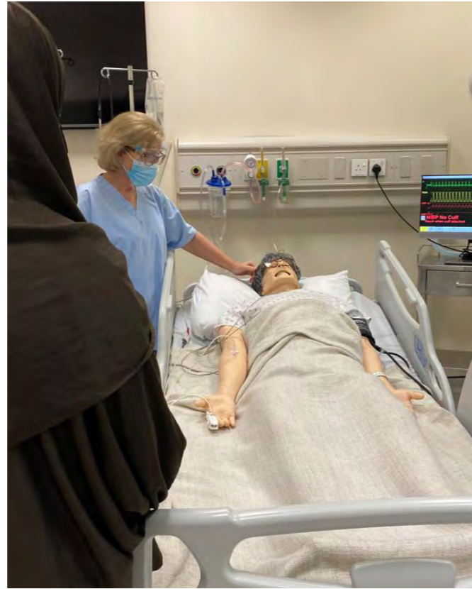
Clinical Skills and Simulation Lab (CSSL) at Weill Cornell Medicine-Qatar

The Foundation Program introduces students to the Clinical Skills and Simulation Lab (CSSL) at WCM-Q to develop their interpersonal and cross-cultural communication as well as teamwork skills through reading journal articles and encounters with standardized patients at CSSL. Students gain a better understanding of the critical role that simulation centers like CSSL play in helping students start forming a professional identity and enhance their communication skills.