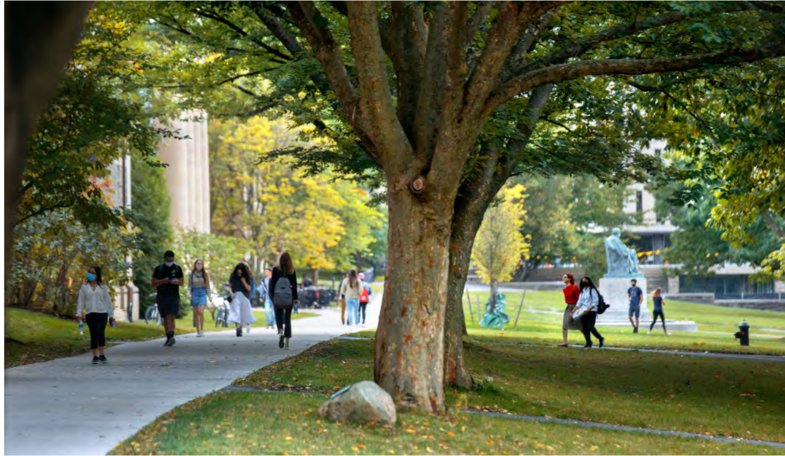
Cornell University, Ithaca, New York

The Foundation Program provides a unique experience for our students to grow academically and personally. It lays a solid foundation for students to be successful in the Six-Year Medical Program and contributes to building a cadre of future Qatari physicians and leaders.