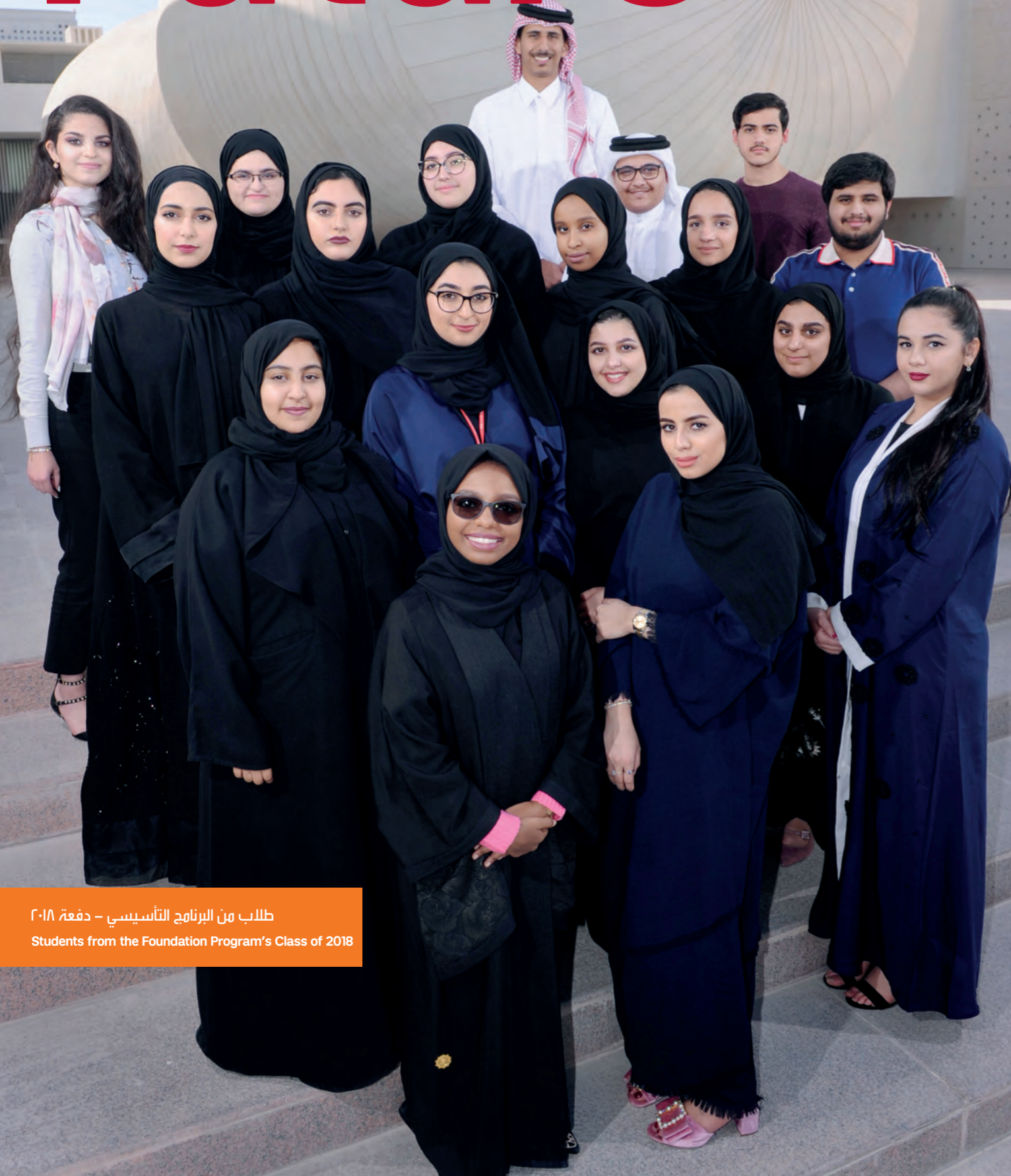
طلاب من البرنامج التأسيسي - دفعة ٢٠١٨ Students from the Foundation Program's Class of 2018