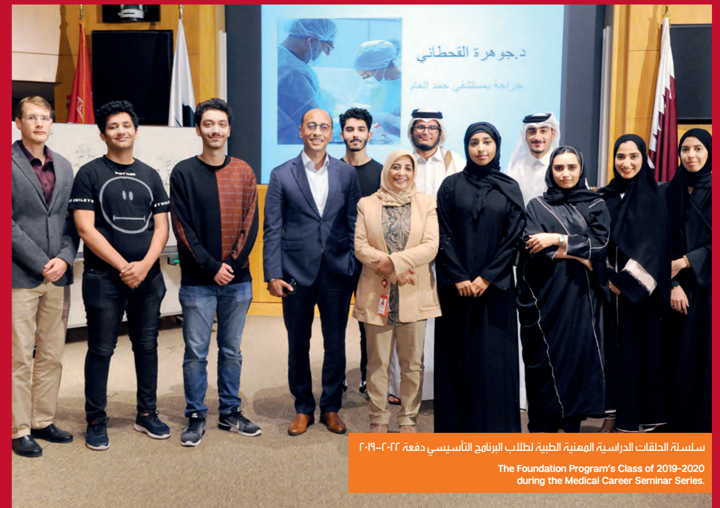
سلسلة الحلقات الدراسية المهنية الطبية لطلاب البرنامج التأسيسي دفعة ٢٠١٩-٢٠٢٢ The Foundation Program's Class of 2019-2020 during the Medical Career Seminar Series.