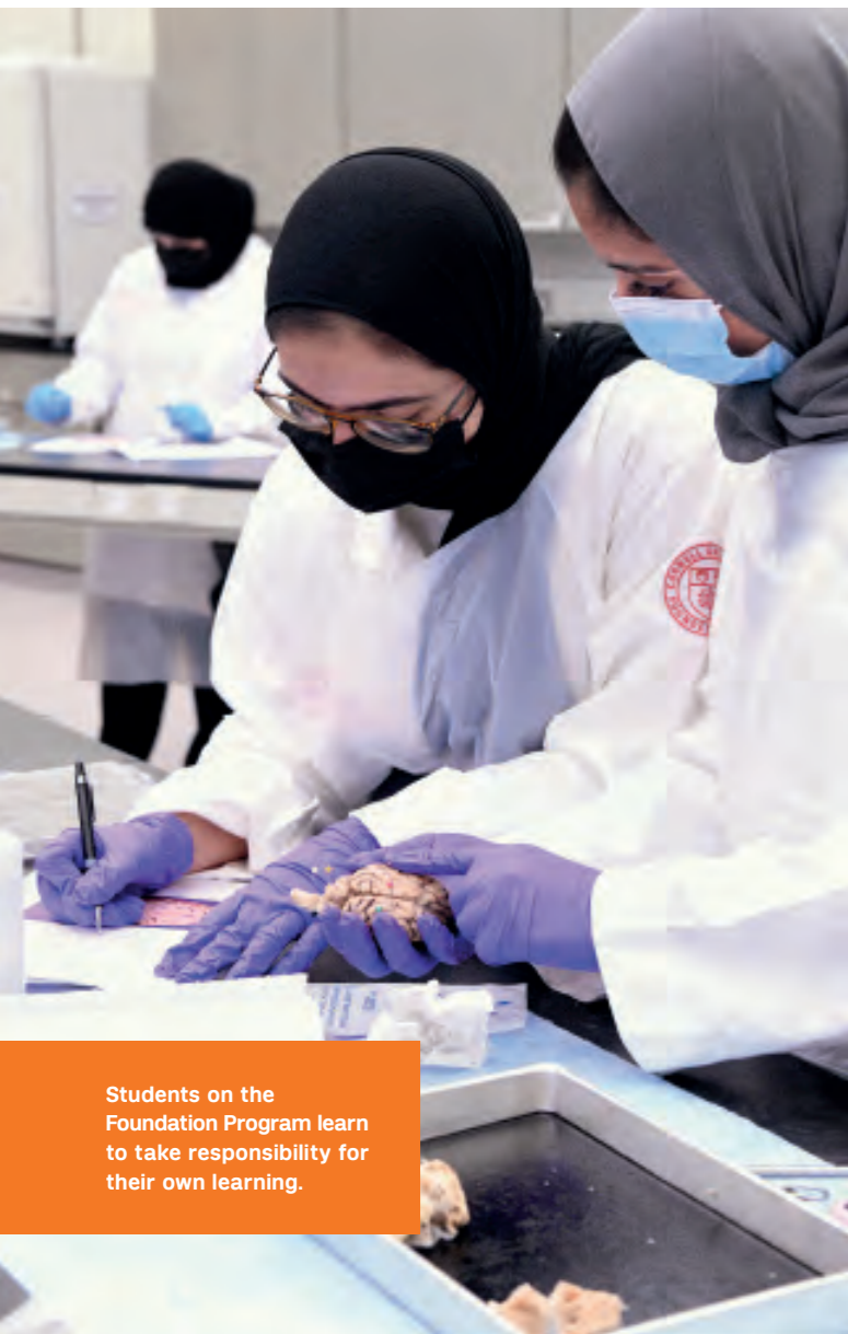
Students on the Foundation Program learn to take responsibility for their own learning.

Designed to help students achieve success on the Six-Year Medical Program, the Foundation Program has a focus on reinforcing students' existing knowledge and providing them with the academic background to allow them to take on the challenges they will face when studying medicine.