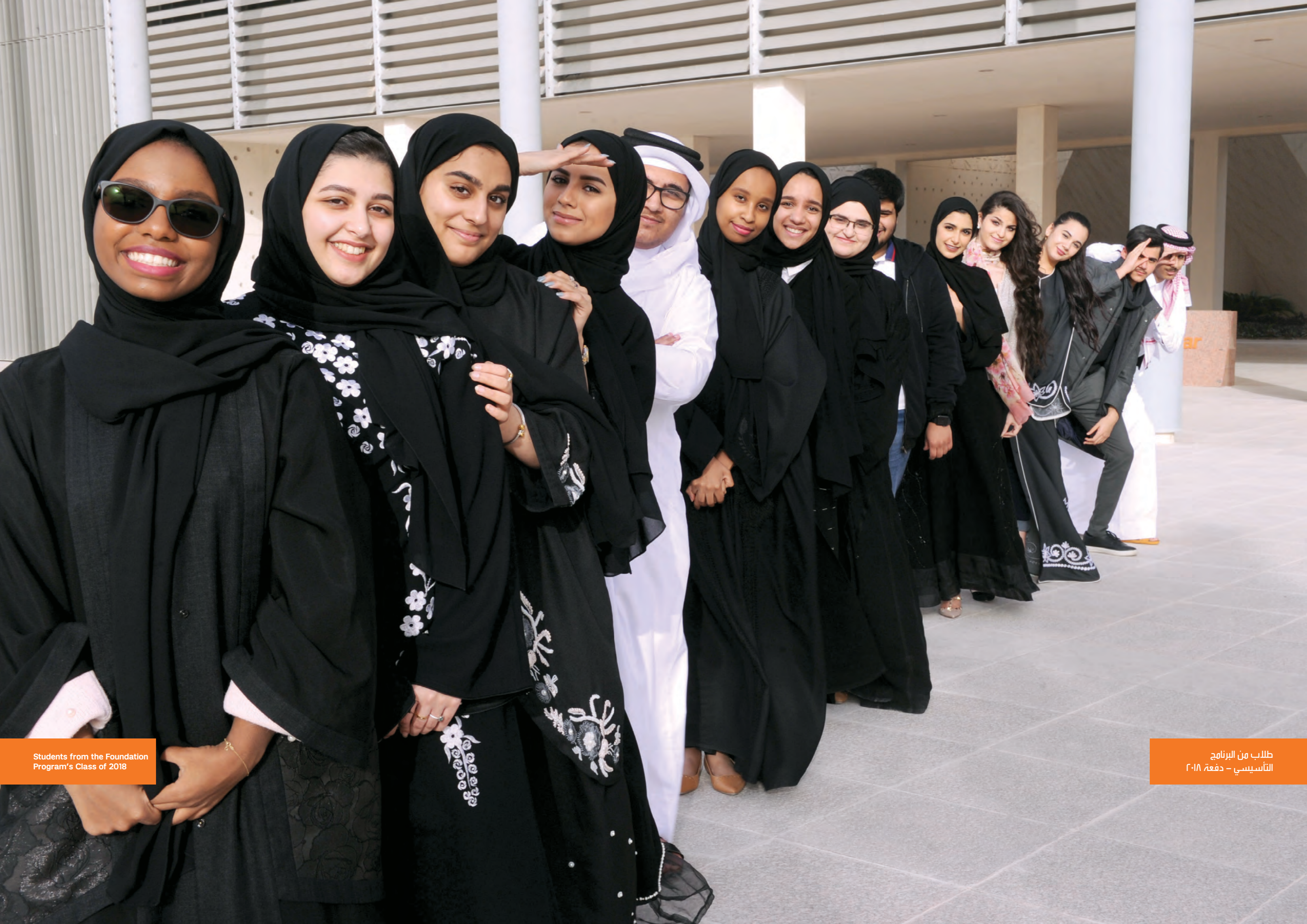
Students from the Foundation Program's Class of 2018