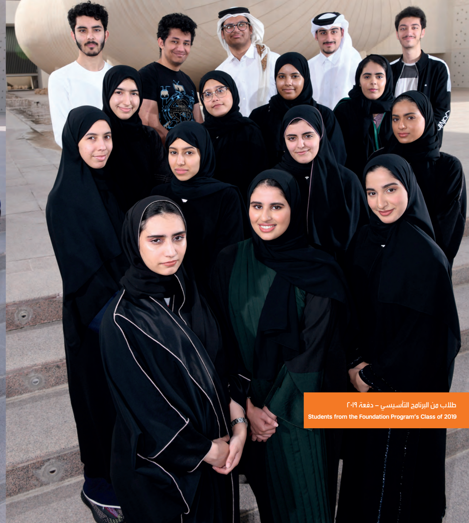
طلاب من البرنامج التأسيسي - دفعة ٢٠١٩ Students from the Foundation Program's Class of 2019