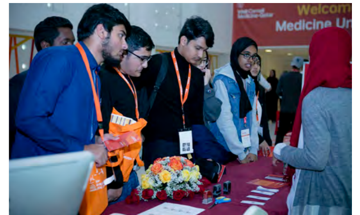
Outreach is an important driver of recruitment to the Foundation Program.

focused on providing one-on-one support where necessary. The introduction of teaching specialists was also an inspired initiative, providing faculty with day-to-day classroom support, and, most importantly, introducing an additional layer of help for students.