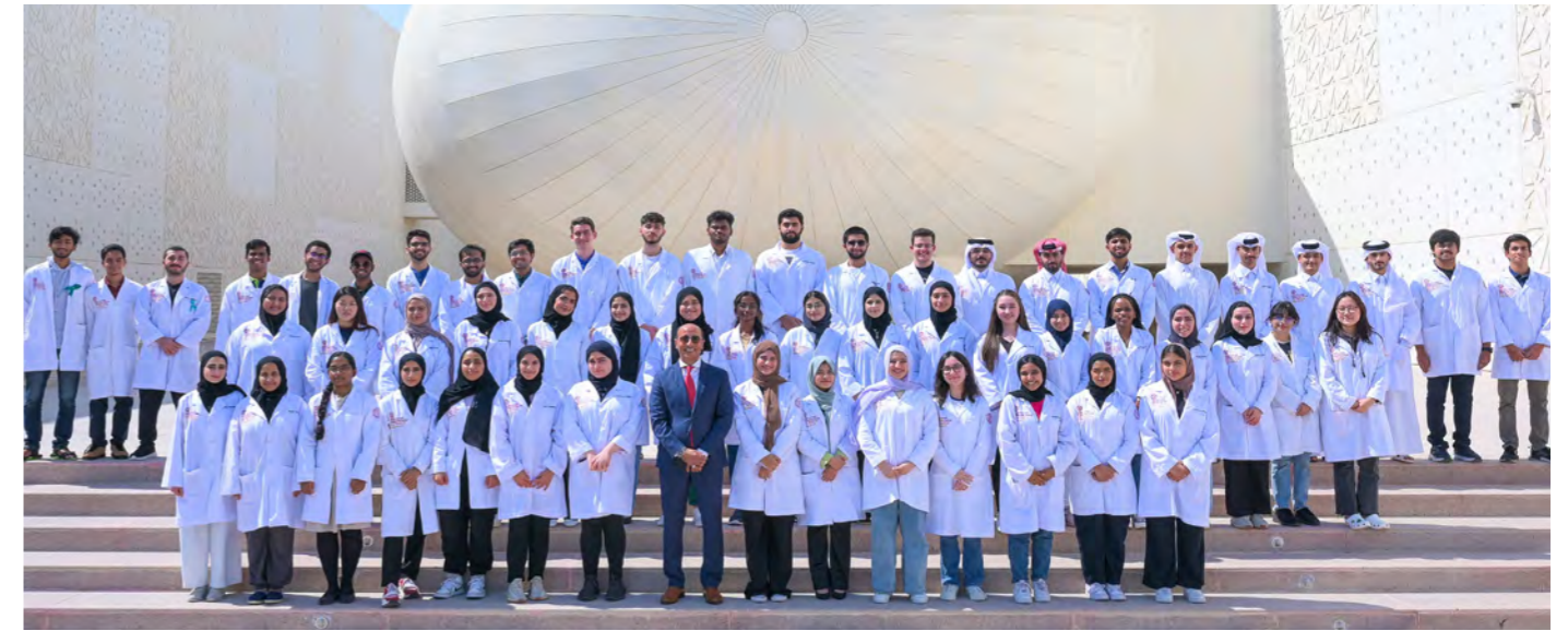
Pre-medical Observership Program 2022-2023